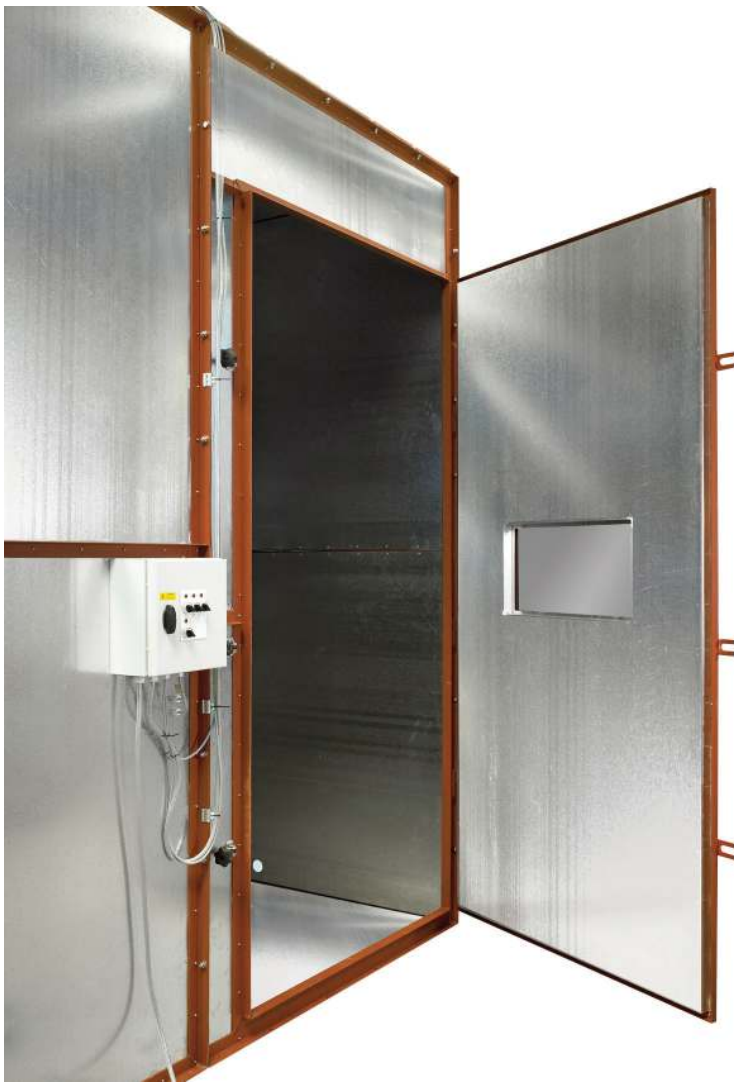
Detail of door with viewing panel and control box at the front of the cube