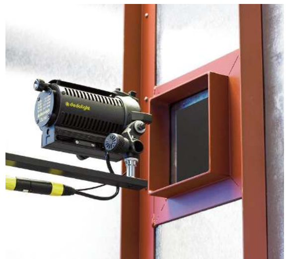
Detail of light source and detector at opposing apertures