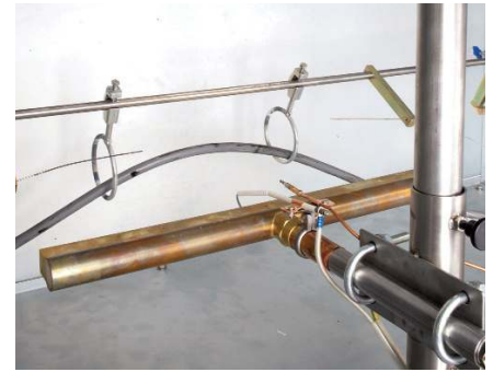
Ring Clamps for Resistance to Fire Alone Testing

Electrical continuity is checked throughout a 3-hour exposure to the gas burner set at an appropriate temperature.