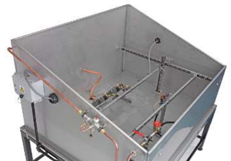
Resistance to Fire with Water (Protocol W)

The water spray is then switched on, in order to comply with the standard BS 6387 (Protocol W), the cable must maintain electrical integrity whilst both water and flames impinge on the cable for a further 15 minutes.